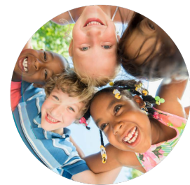
Kids Play Village